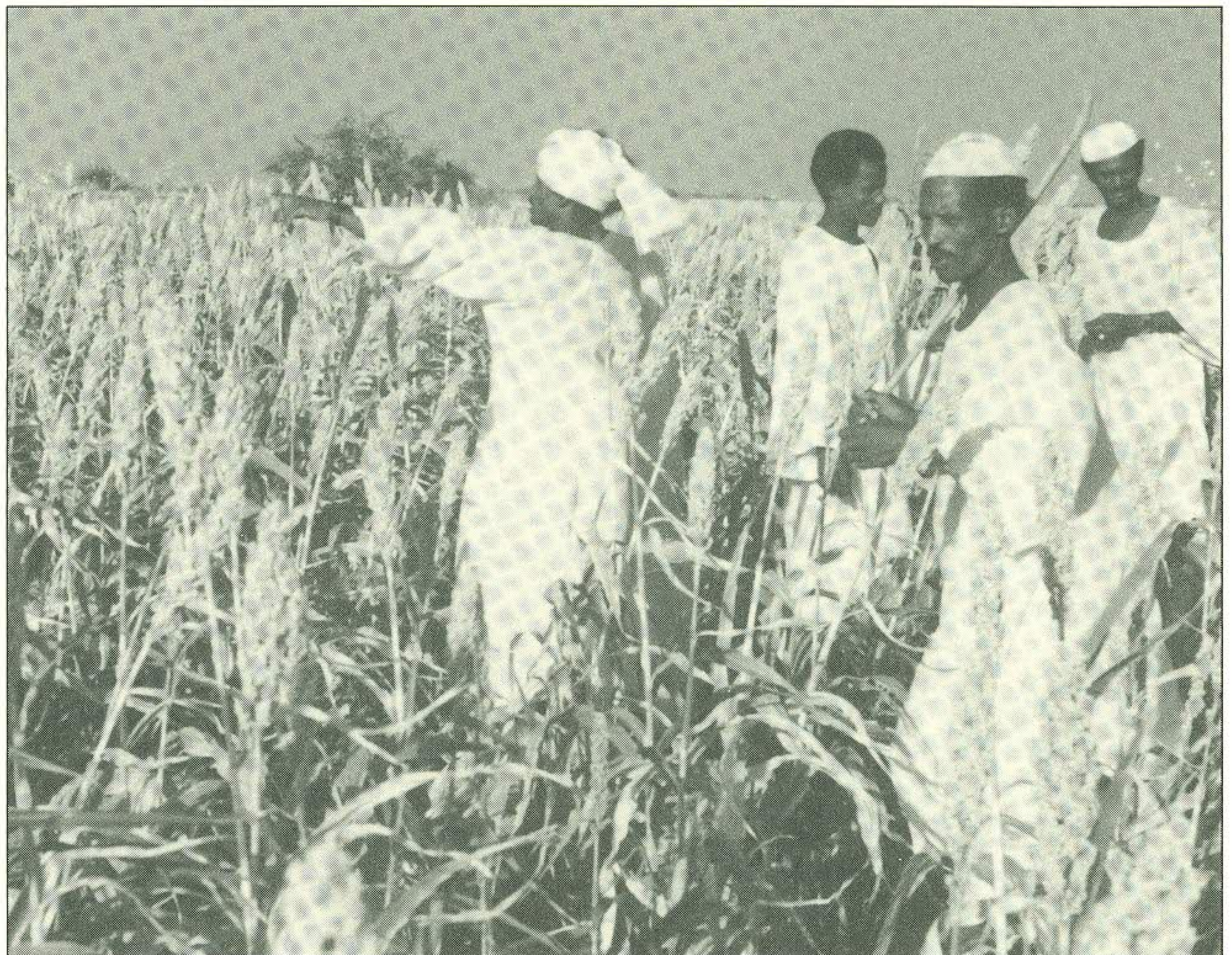
Farmers working on demonstration plot in the Sudan. Global 2000 helps native subsistence farmers in Ghana, the Sudan, and Zambia become more self-sufficient in crop production.