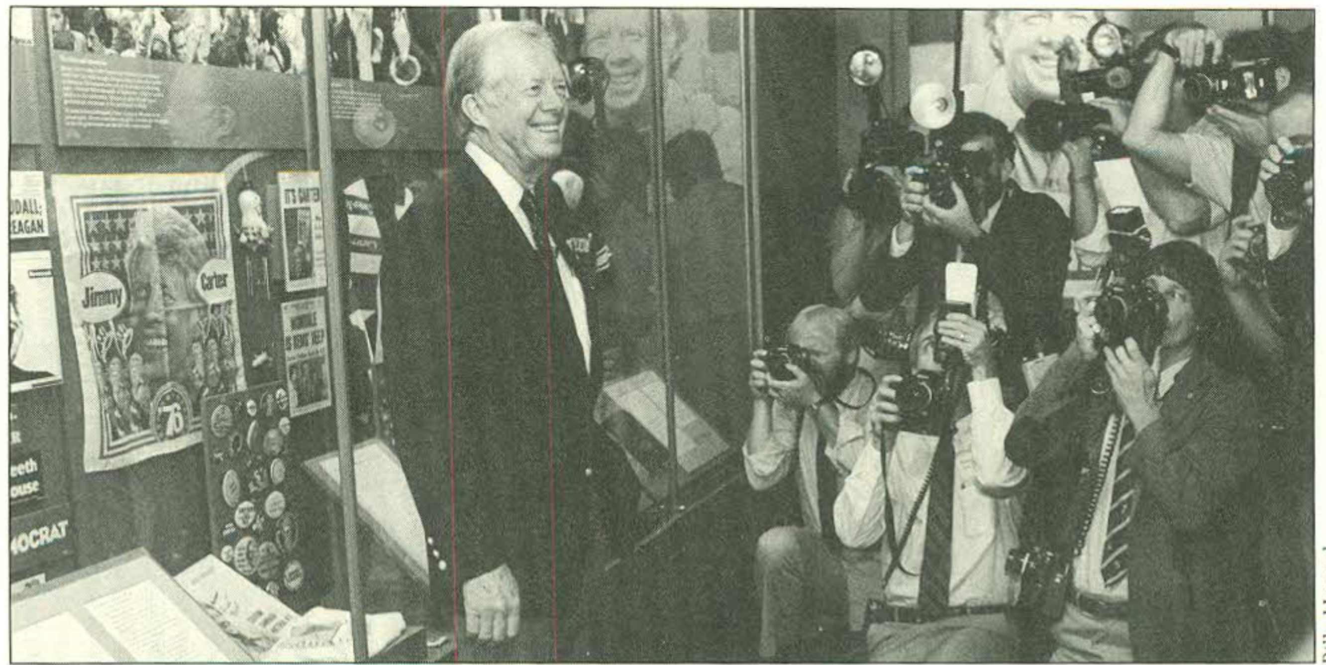
President Carter explains an exhibit at the Carter Library to reporters.

Other material open for research includes memoranda from White House staff members advising the President on national and international policies; reports to the President; and correspondence between President Carter and national and world leaders on topics ranging from the environment,